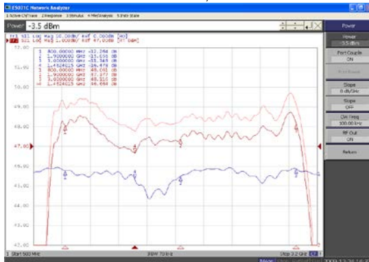
Plot 2 – Small Signal Gain and P SAT

Top Curve: Small Signal Gain @ P IN = -20dBm Middle Curve: Power Gain @ P 1dB , P IN = -3.5dBm Reference: 47dB, 1dB/div. Bottom Curve: Input Return Loss Reference: 0dB, 10dB/div.